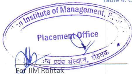
Table 4: Classification of Placements Based on Location